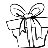
Buy giftcard Ask at the bar